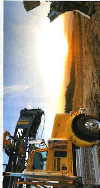
Weeks Drilling & Pump Company stands by its motto: "When you trust us, we think of Weeks."