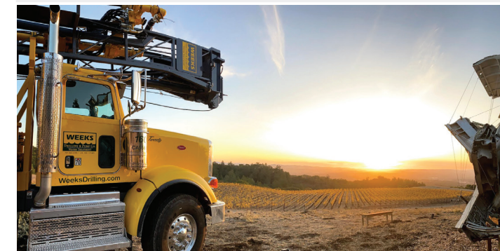
Weeks Drilling & Pump Company stands by its motto: "When you think of water, think of Weeks."