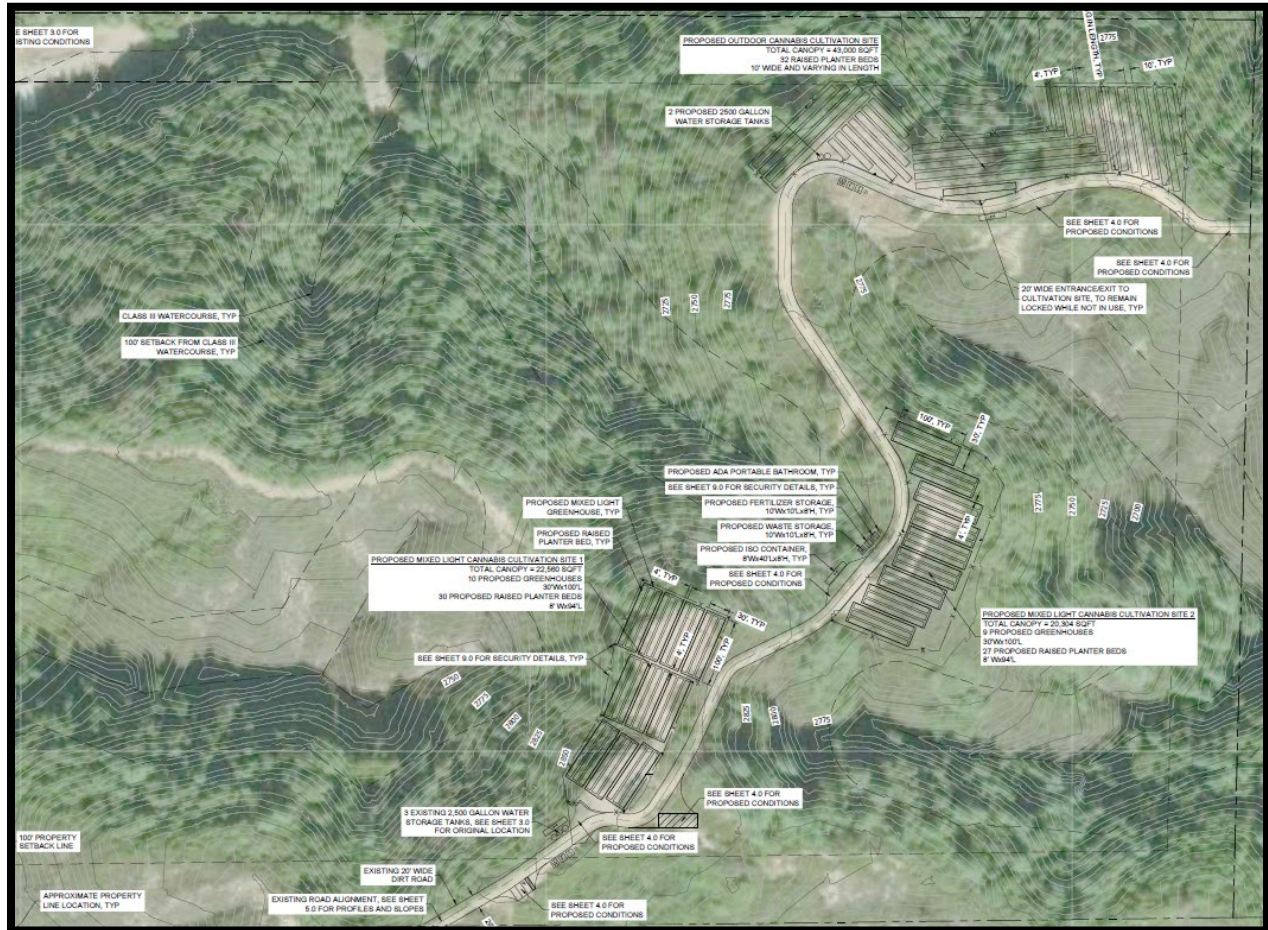
FIGURE 1 – AERIAL PHOTO OF SITE AND SURROUNDING AREA