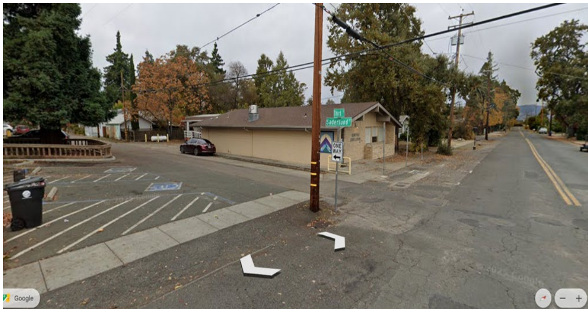
Figure 2- Existing Building