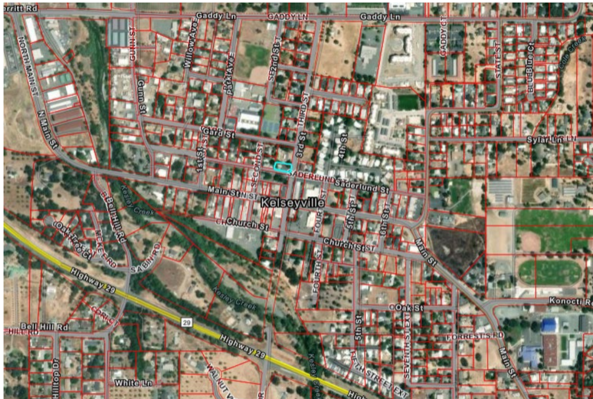
Figure 1- Vicinity Map