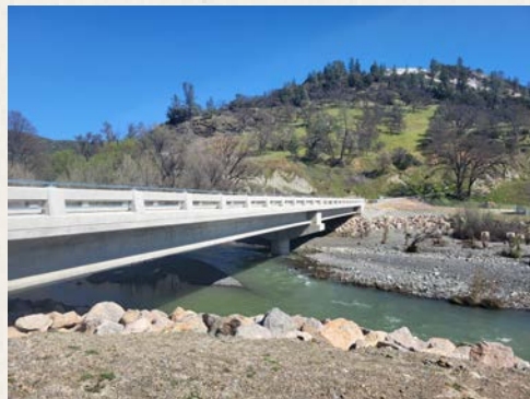
Chalk Mountain Road Bridge

One notable exception for funding is the Armory renovation project, which carries secured multi-year financing through a combination of the County's first ever bond issuance and dedicated Federal funds, making it the singular project in this inaugural CIP with funding guaranteed beyond the current fiscal year.