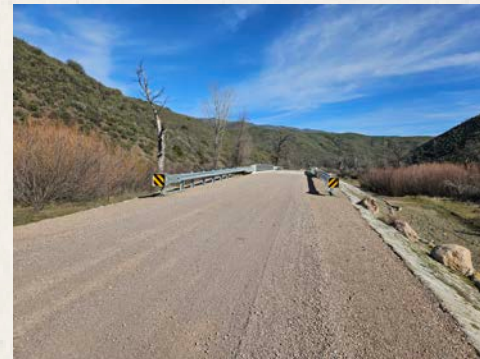
Bartlett Springs Road Bridge