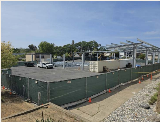
Courthouse Solar Array & EV Charging

Public Works oversees the County's buildings, parks, and landfill. The four-year CIP for facilities totals approximately $67.8 million. Parks and integrated waste management represent the largest investment categories at roughly $15.7M and $20.3M respectively, followed by public safety facilities ($7.7M) and water resources ($6.2M). The Armory renovation — a $10 million adaptive reuse of the historic Armory building as the new Sheriff's Administration headquarters, stands as the plan's signature project, uniquely secured through bond financing and Federal appropriations.