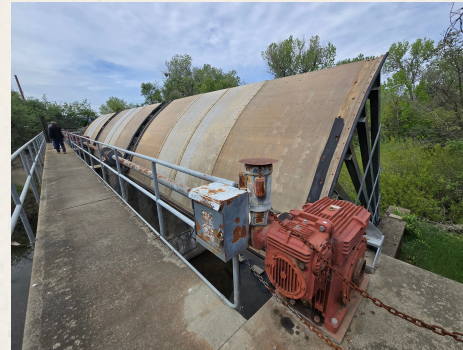
Kelsey Creek Detention Structure