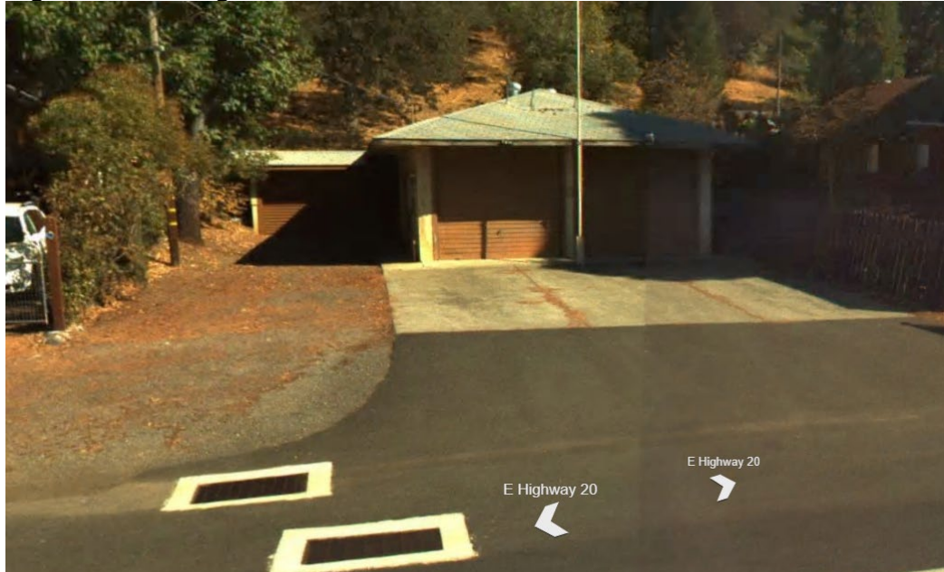
Figure 2- Existing Structure