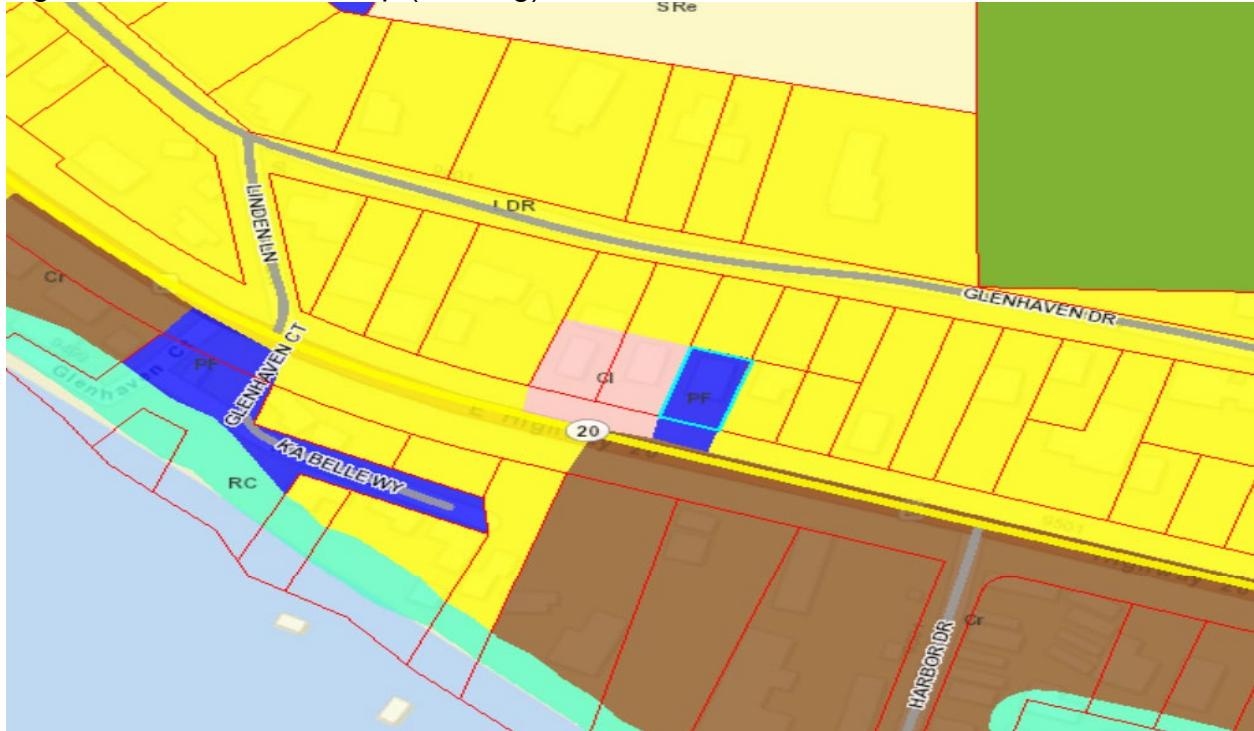
Figure 4: General Plan Map (Existing)

The existing general plan designations for the parcel and surrounding sites are shown below in Figure 4.