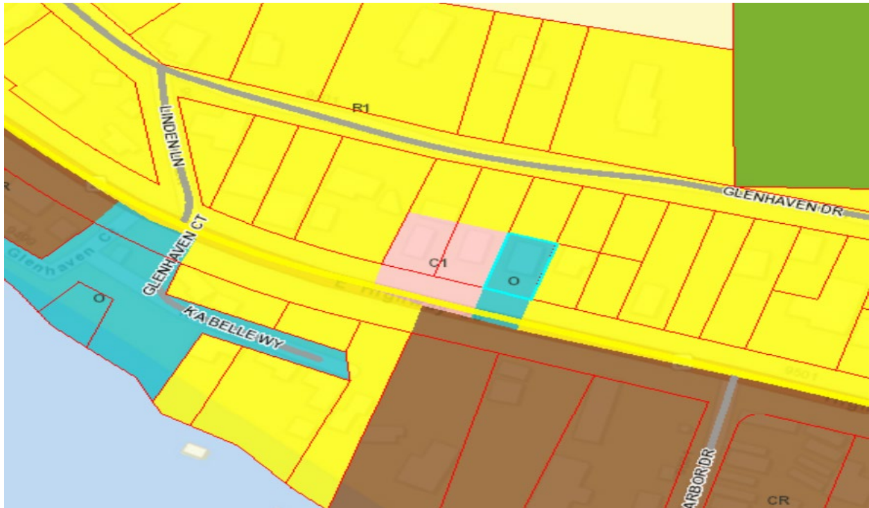
Figure 3: Zoning Map (Existing)