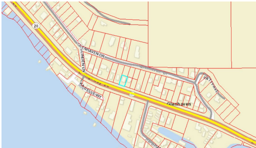
Figure 1-Vicinity Map

The proposed project includes a rezone to change the zoning designation from "O-SC" Open Space – Scenic Combining to "R1-SC" Single-Family Residential - Scenic Combining, and a general plan amendment to change the general plan designation from "PF" Public Facilities to "R1-SC" Single-Family Residential - Scenic Combining (Attachment 1). Conditions of approval for the project are included in Attachment 2. As a condition of approval for this project, the applicant will be required to get "as-built" permits from the Lake County Community Development Department, Building Division for the previously unpermitted conversion as well as all applicable permits for the rest of the work needed to complete the conversion to a residential structure. Sprinklers will also be required for a conversion to a Residential (R) occupancy 1 now that it will be used as a residence. If the rezone and general plan amendment are approved, the applicant would then upgrade the electrical panel and finish dry walling. No ground disturbance is being proposed with this project.