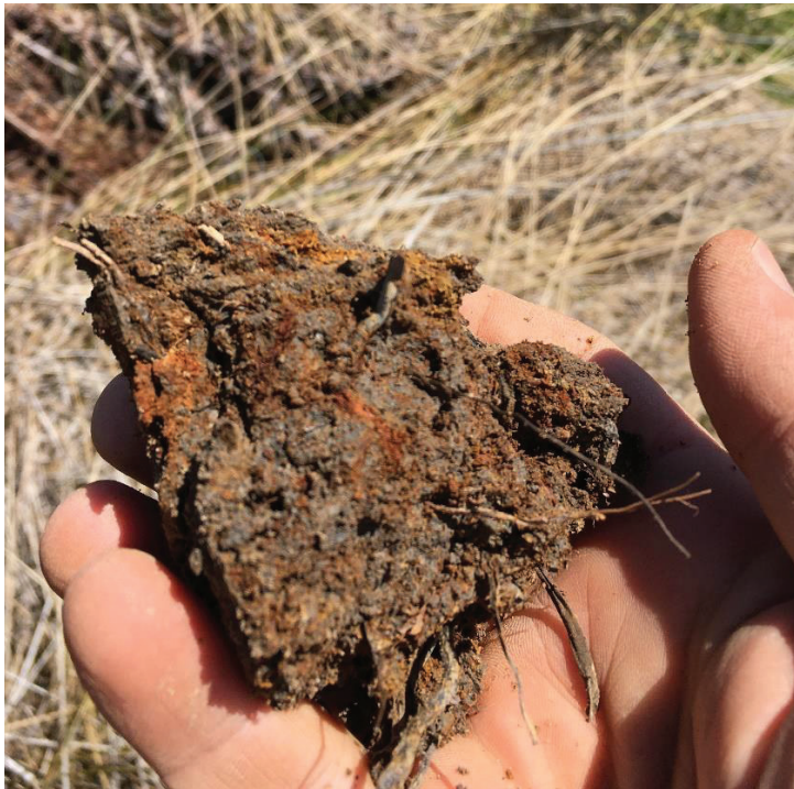
SP-6. 10YR4/1 with 30% 7.5YR4/6 redox concentrations

Soils found with hydric field indicators were a depleted mineral soil with prominent brownish redox concentrations along the pore lining and ped face. Soil texture varied from sandy loam to sandy clay loam. Within Sample Point 6 (SP-6) the hydric soil indicator was a depleted matrix (F3) with a matrix color of 10YR4/1 with 30% 7.5YR4/6 redoximorphic concentrations along the pore lining and ped face.