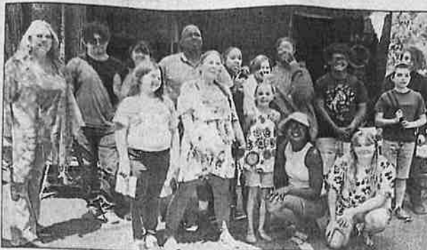
Instructors, volunteers and students from the 2025 South Lake Alliance Children's Museum of Art and Science band camp.

She then went on to state that if CMAS "was not there in Clearlake, this would not be happening. It's more so about what they do for all us parents. It was truly a tremendous band camp."