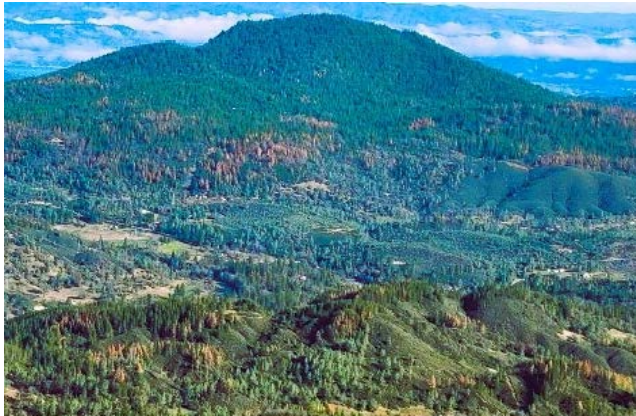
Figure 1. Conifer mortality in Lake County.

Noticeable decline of several conifer species in the North Coast region was first observed in 2020. Field observations detected extensive evidence of bark beetle activity in declining conifers and subsequent increases in conifer mortality suggested the area was at the incipient stage of a bark beetle outbreak. Monitoring and aerial flight surveys conducted by CAL FIRE Forest Health Specialists in spring 2022 confirmed a landscape scale outbreak (Fig. 1).