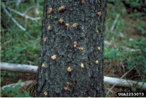
Pitch tubes from multiple bark beetle attacks.

When foraging bark beetles find a suitable host tree, they release aggregation pheromones that attract more beetles to the tree. The beetles collectively attack the tree to overwhelm its natural defenses and successfully colonize the tree.