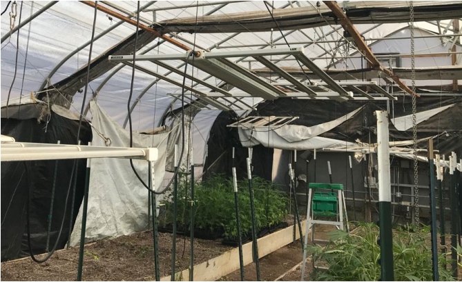
Figures 5-8: Cultivation in both unpermitted structures, with mold-like substance present