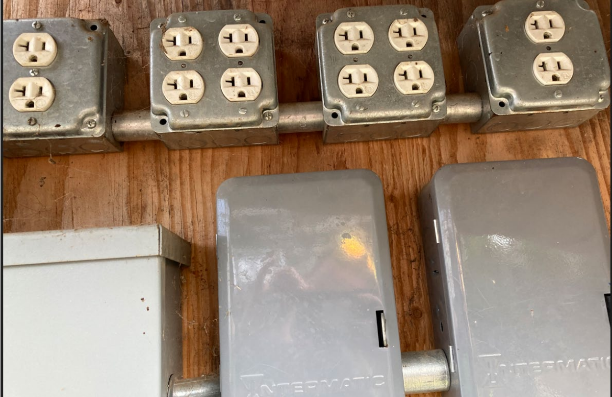
Figure27-29: Unpermitted construction in progress