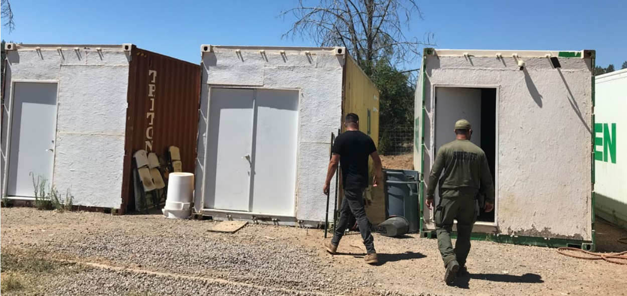
Figures 12-22: Cargo containers approved for storage but used for unpermitted cannabis manufacturing