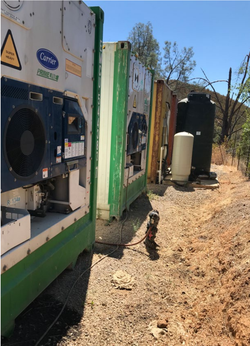
Figures 23-26: Unpermitted electrical and HVAC systems in cargo containers