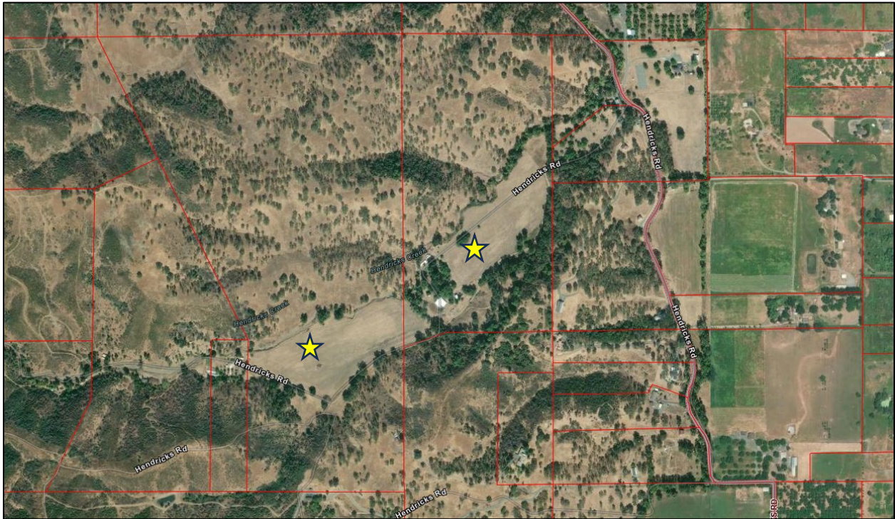
Figure 1 – Vicinity Map