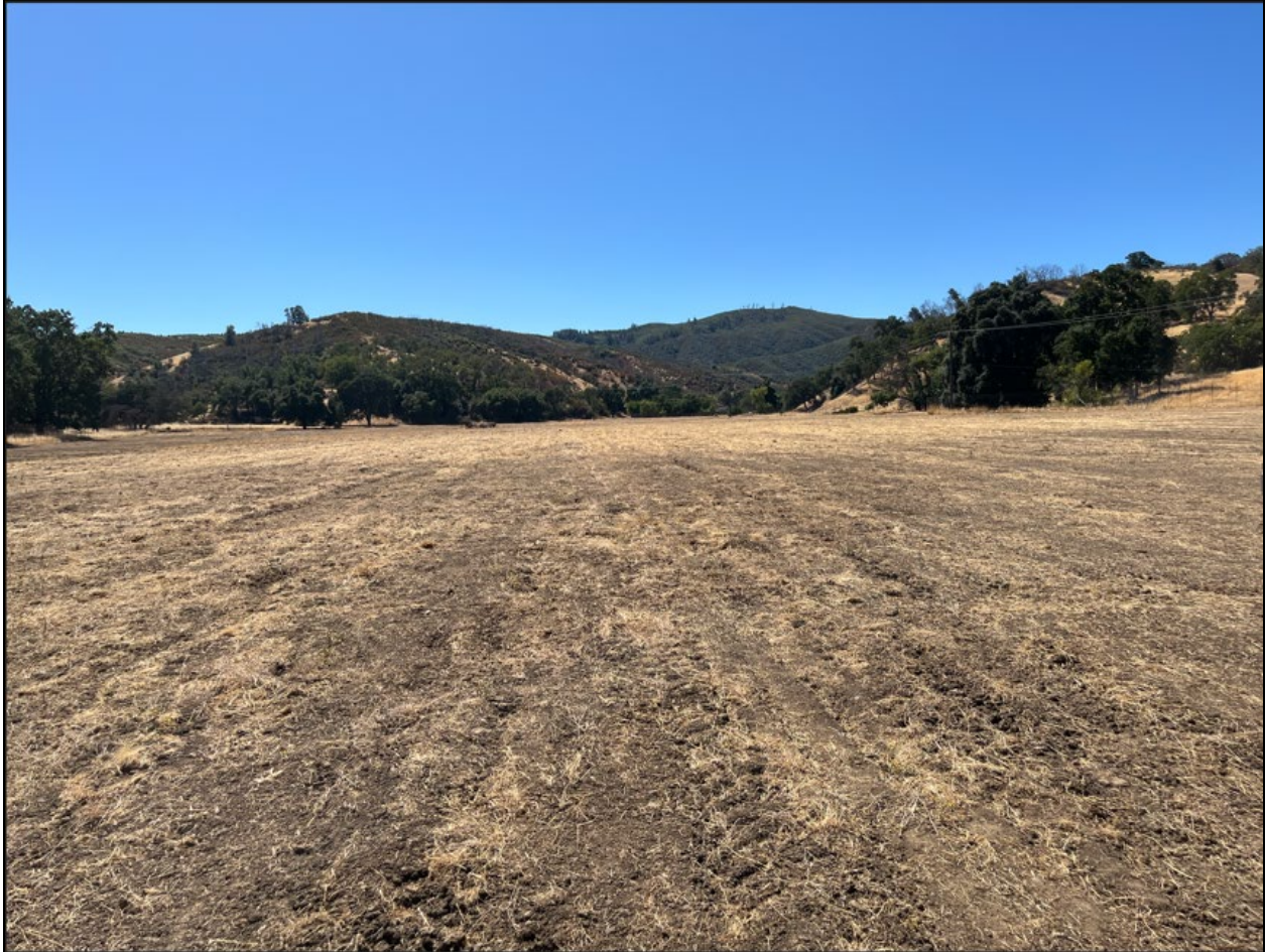
Figure 3 – Site Photo

Surrounding parcel consists of lands zoned for Rural, Agricultural, and Agricultural Preserve uses. Existing development in the area is comprised of a blend of single-family residences and established farming activities. The nearest off-site residence is \pm 400 ft to the west and \pm 815 ft to the east of the proposed cannabis canopy.