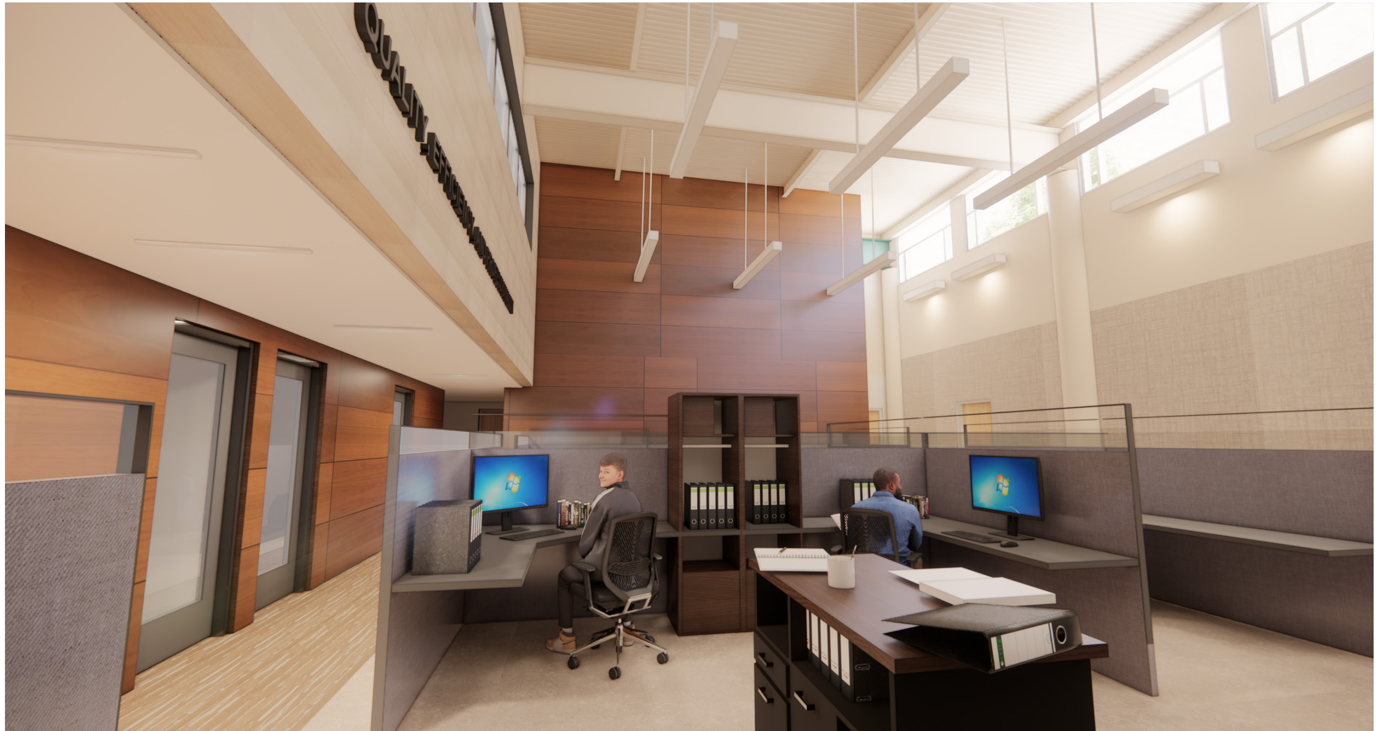
LAKE COUNTY + DEWBERRY REMODEL OF NATIONAL GUARD ARMORY TO SHERIFF ADMINISTRATION FACILITY VIEW: DETECTIVE'S AREA