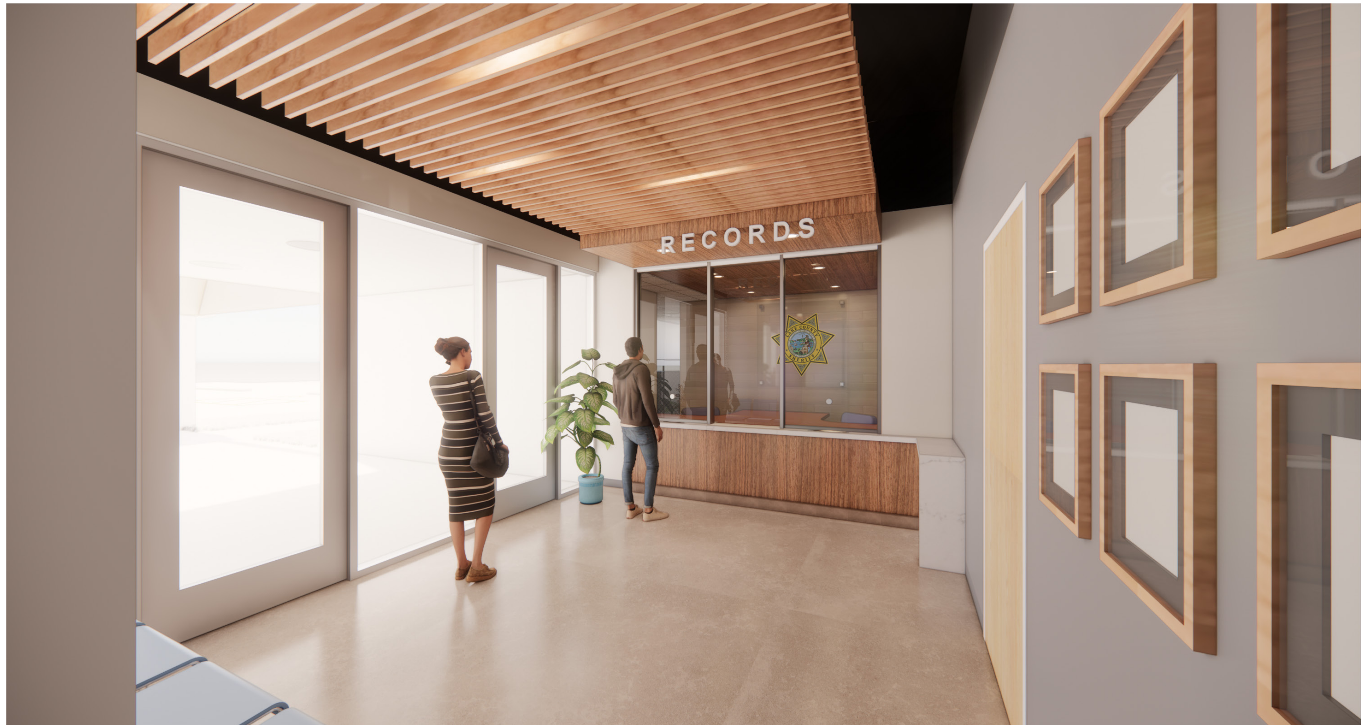
LAKE COUNTY + DEWBERRY REMODEL OF NATIONAL GUARD ARMORY TO SHERIFF ADMINISTRATION FACILITY VIEW: PUBLIC LOBBY