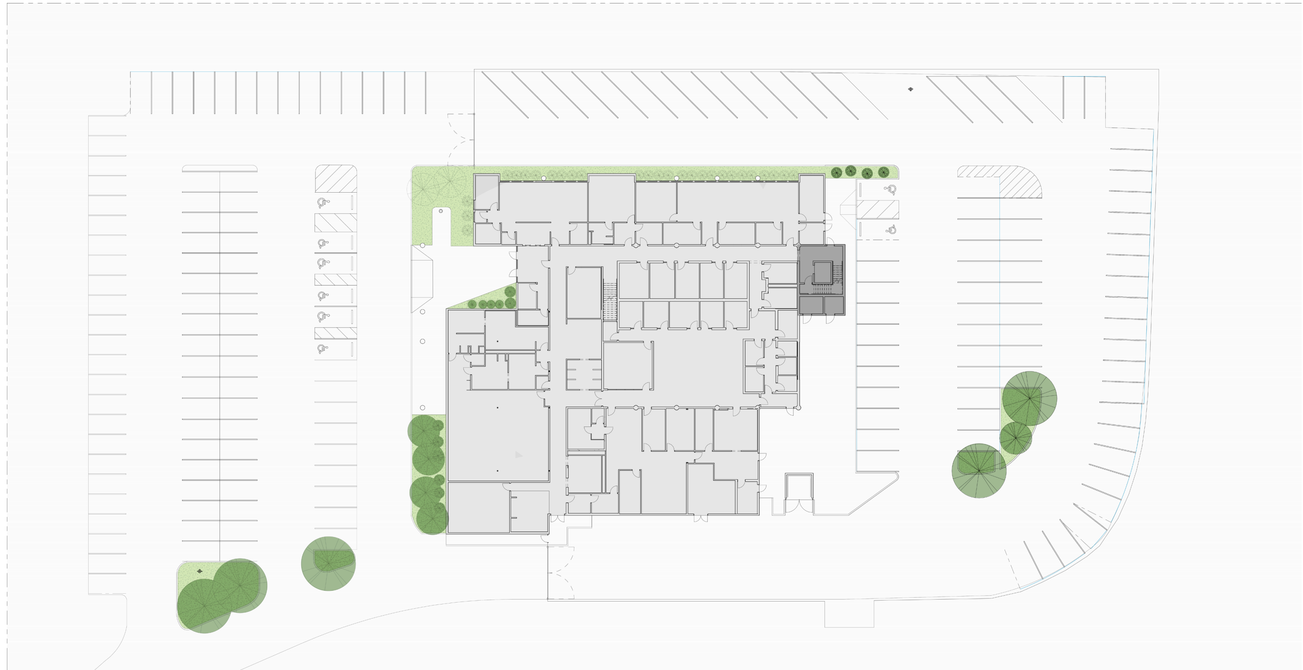
LAKE COUNTY + DEWBERRY REMODEL OF NATIONAL GUARD ARMORY TO SHERIFF ADMINISTRATION FACILITY VIEW: OVERALL SITE PLAN