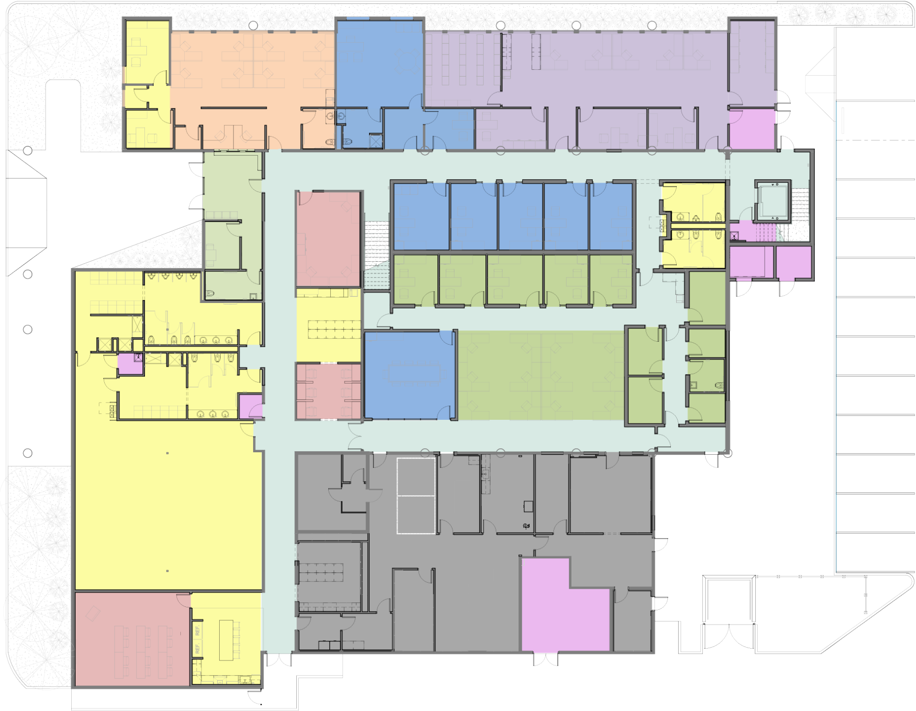
LAKE COUNTY + DEWBERRY REMODEL OF NATIONAL GUARD ARMORY TO SHERIFF ADMINISTRATION FACILITY VIEW: LEVEL 1 SPACE PLAN