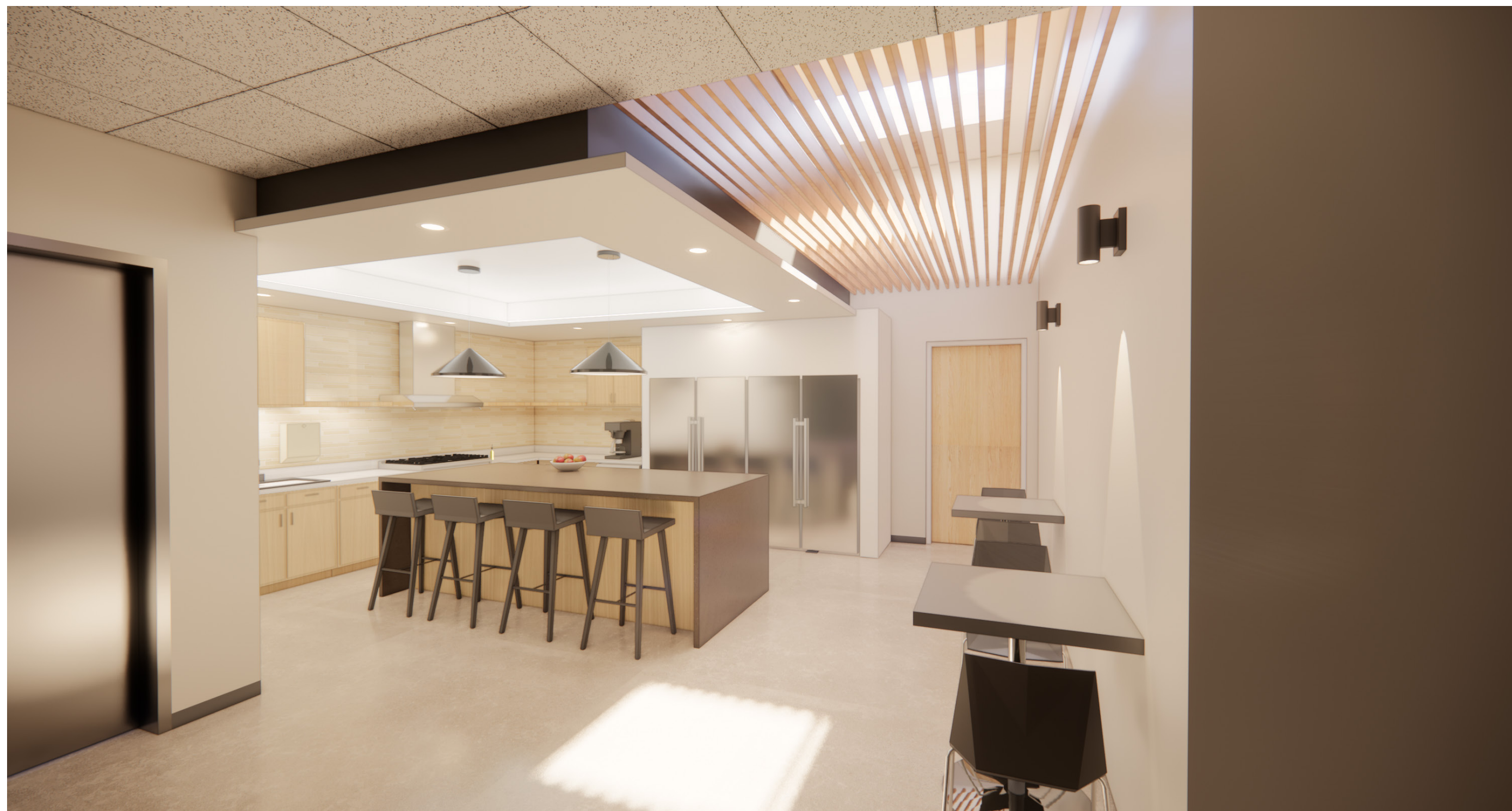
LAKE COUNTY + DEWBERRY REMODEL OF NATIONAL GUARD ARMORY TO SHERIFF ADMINISTRATION FACILITY VIEW: BREAKROOM