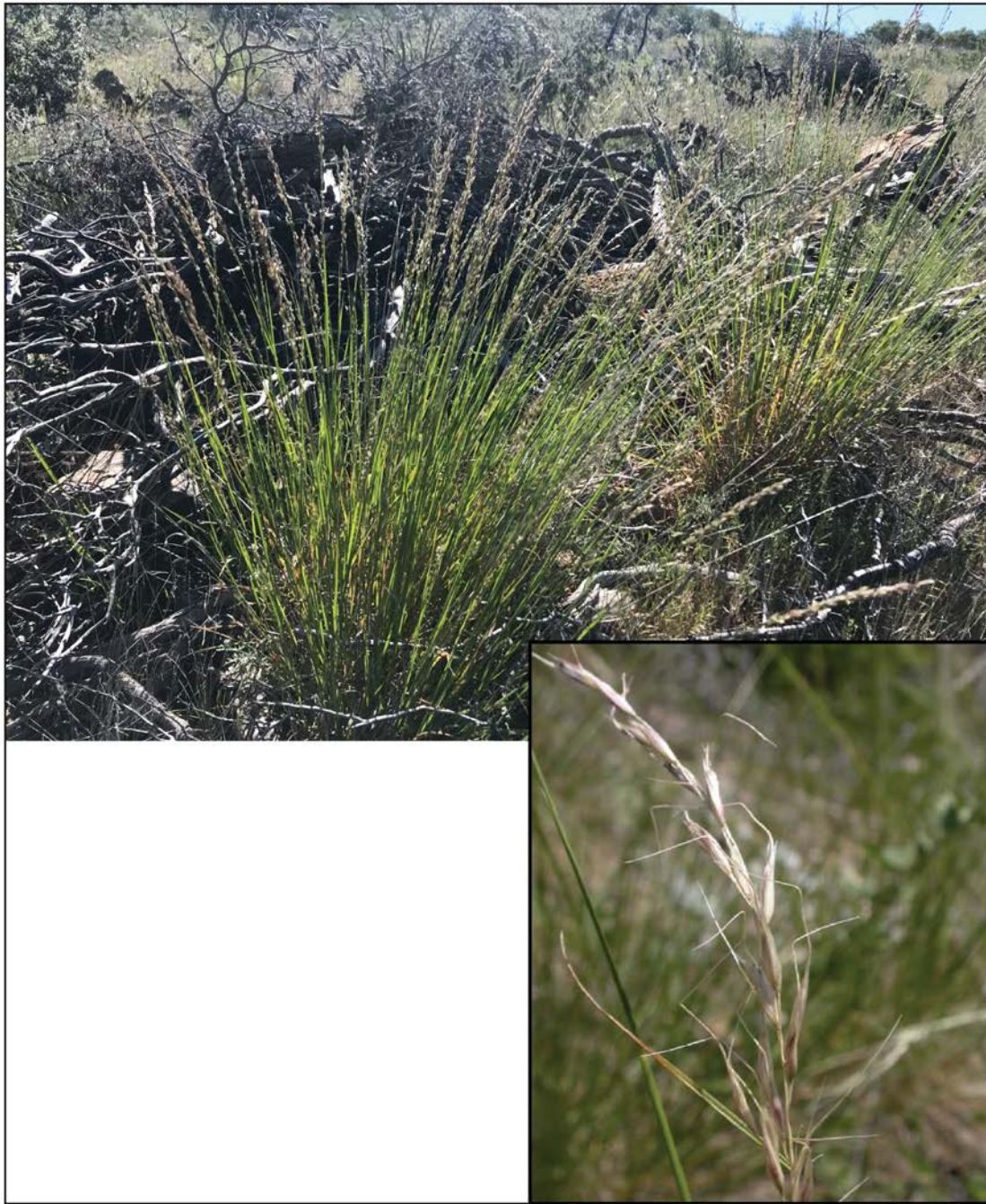
Lemmon's Needle Grass ( Stipa lemmonii var. pubescens )