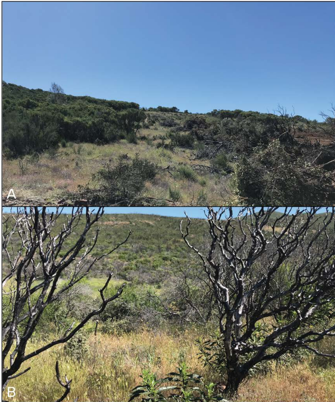
Photograph of Jennings Parcel Burned Area Ecotones