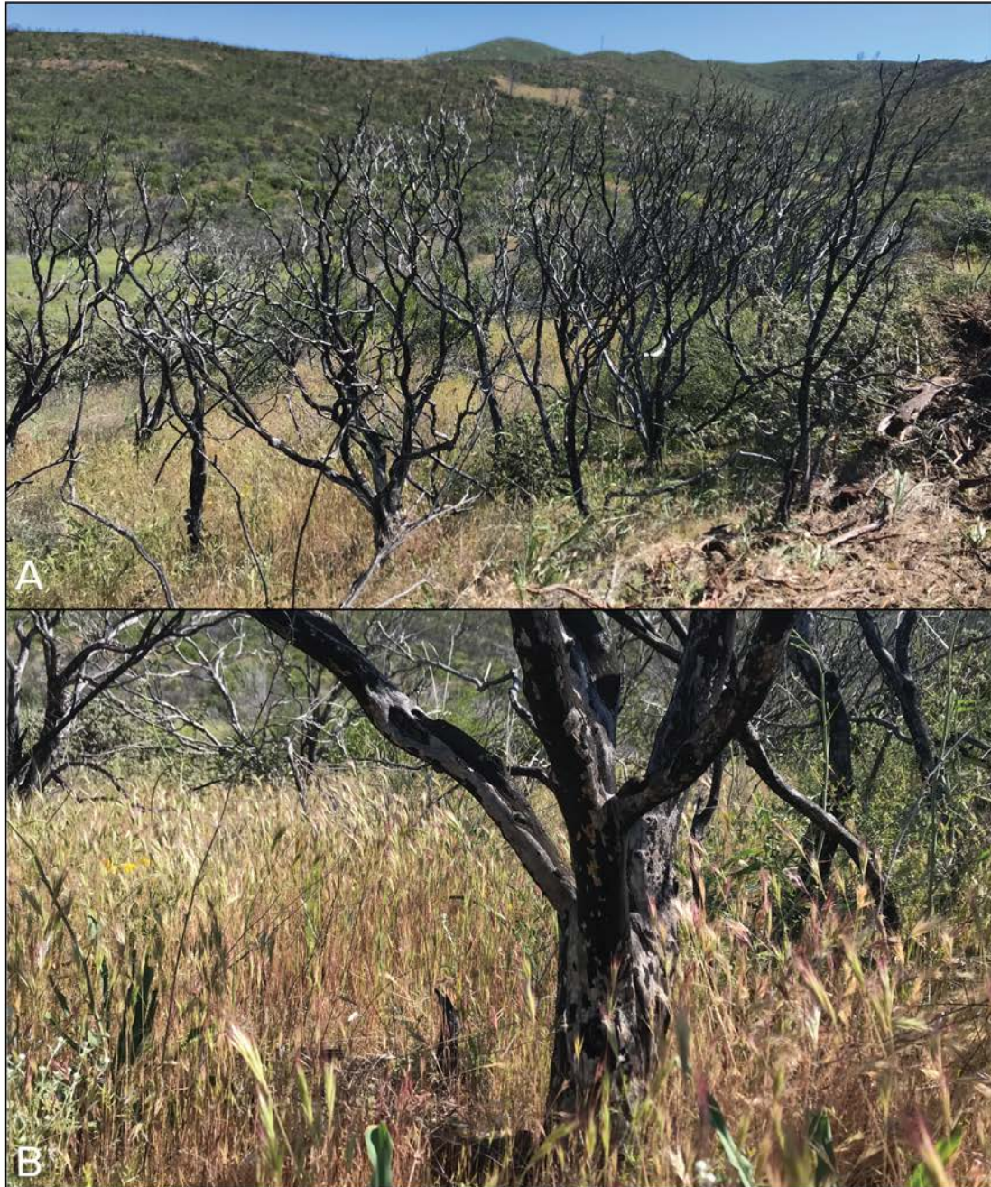
Photograph of Jerusalem Fire Plant Mortality