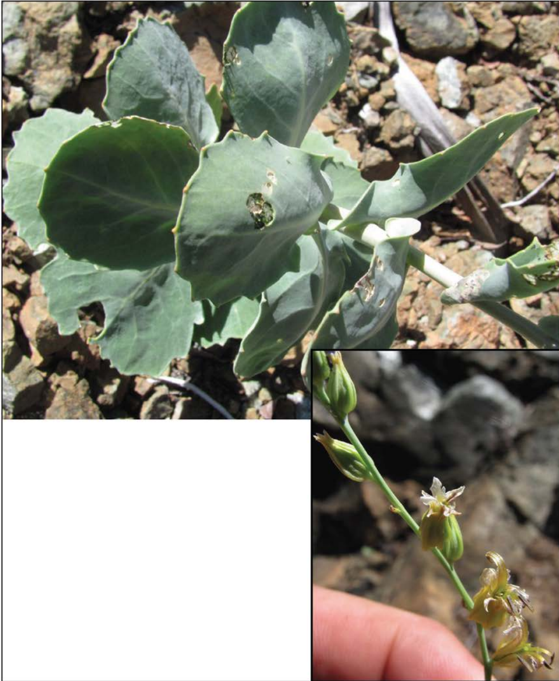
Morrison's Jewelflower ( Streptanthus morrisonii ssp. morrisonii )