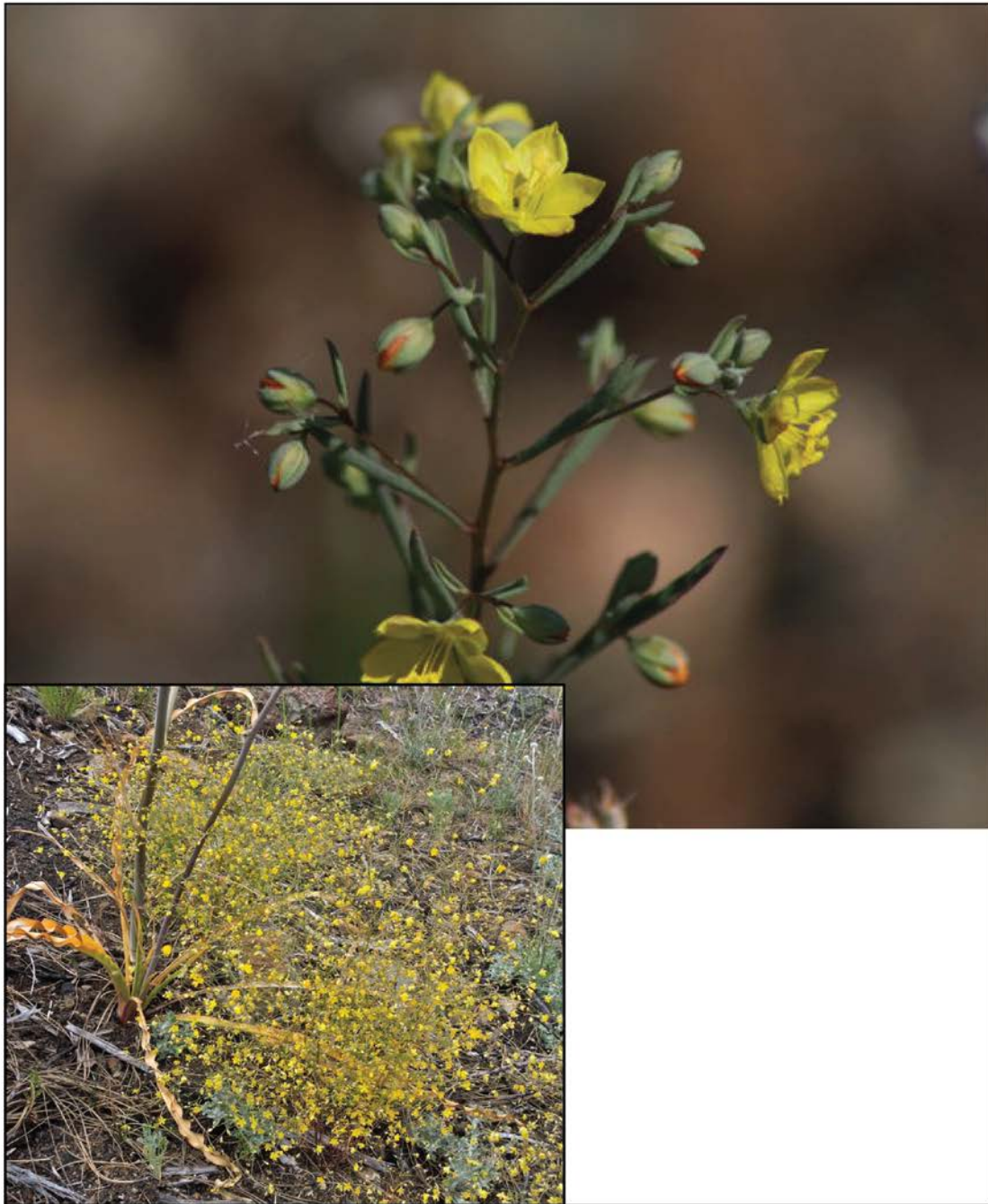
Bicapellate Western Flax ( Hesperolinon bicarpellatum )