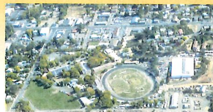
The Lake County Fairgrounds