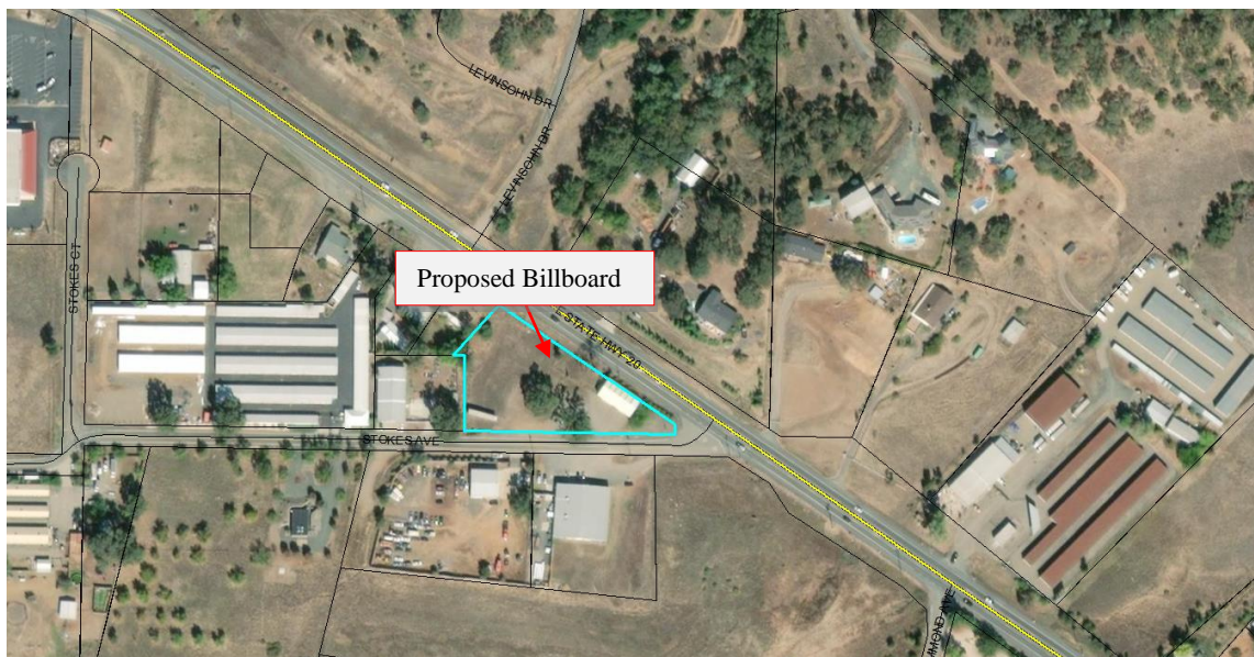
Aerial Photo of Site and Surrounding Properties