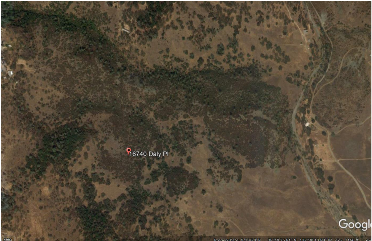
Aerial Photo of Site and Surrounding Properties

Other public agencies whose approval may be required (e.g., Permits, financing approval, or participation agreement.)