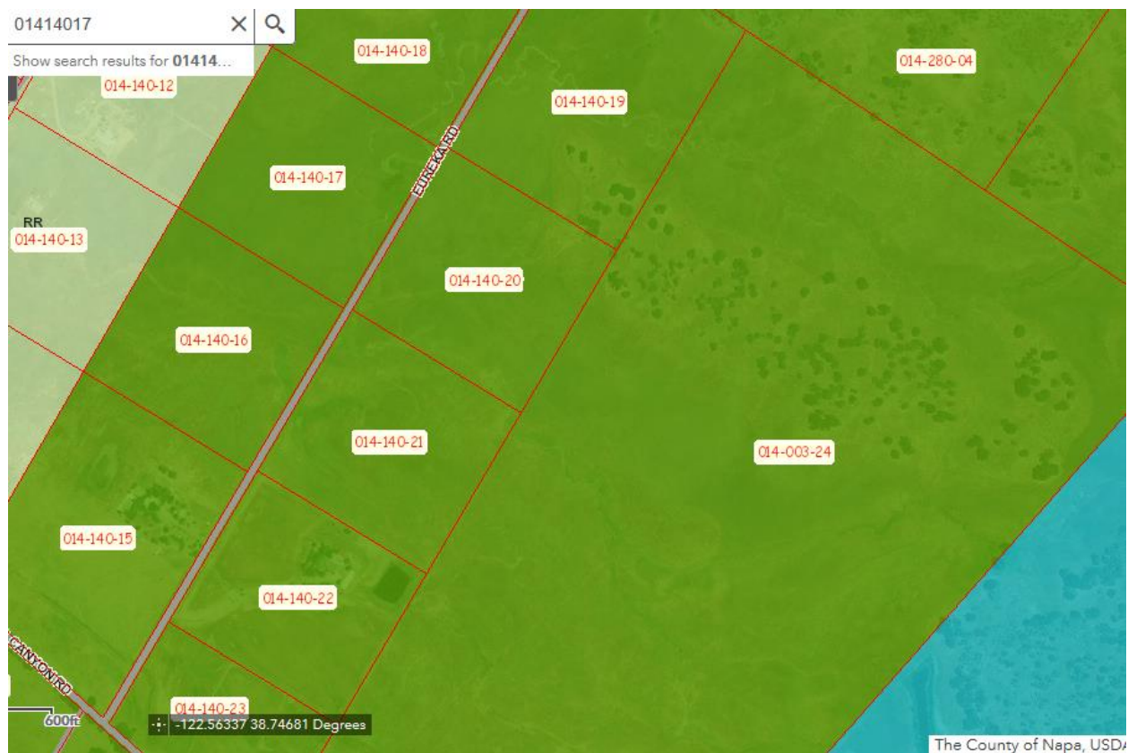
Zoning of Site and Surrounding Properties

West: Rural Lands; large lots with several dwellings