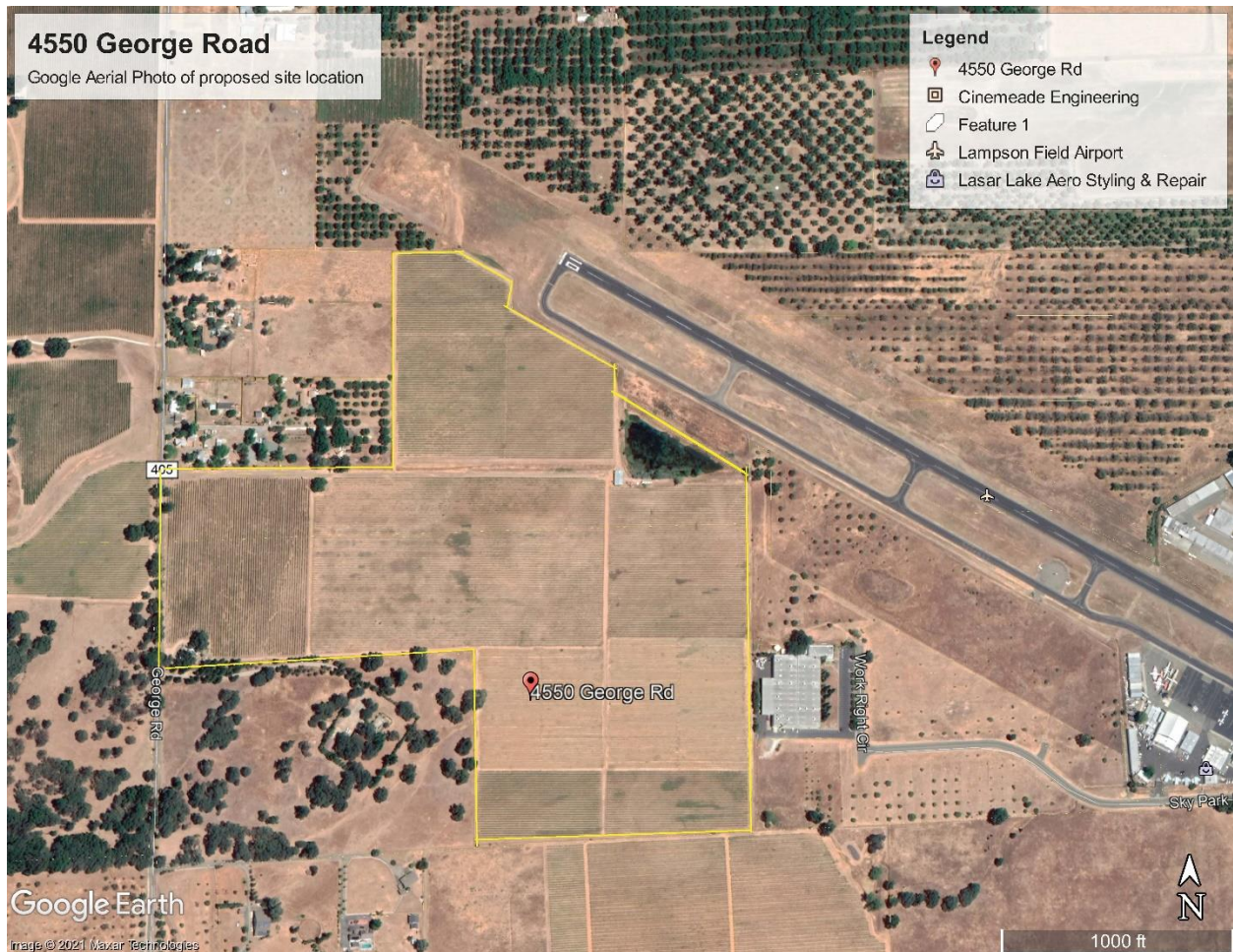
Figure 3. Aerial Photo of Subject Site