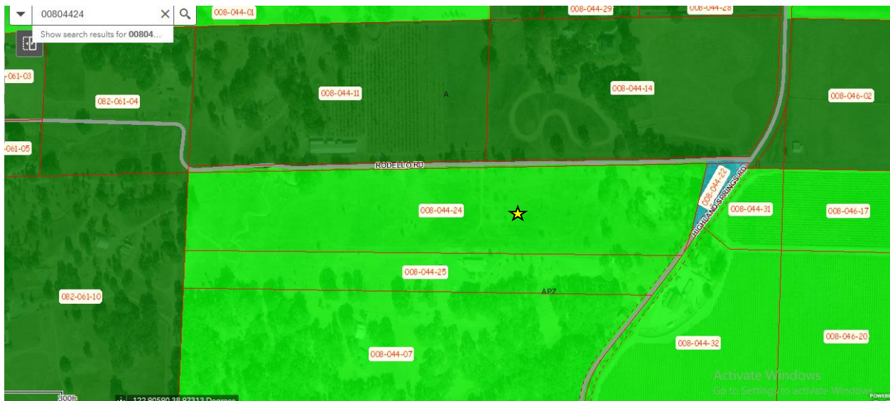
Zoning Map of Site and Vicinity

South: “APZ” Agricultural Preserve land with dwellings and no visible agricultural uses. One house is located immediately south of the proposed cultivation site.