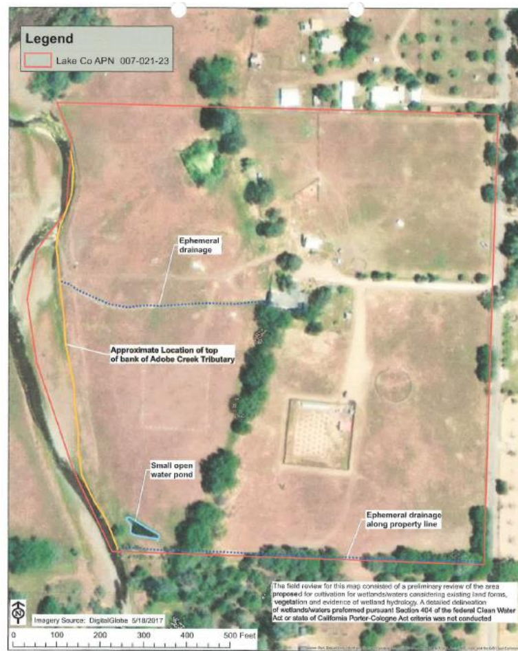
Figure 1. Aquatic Features Present at APN 007-021-23