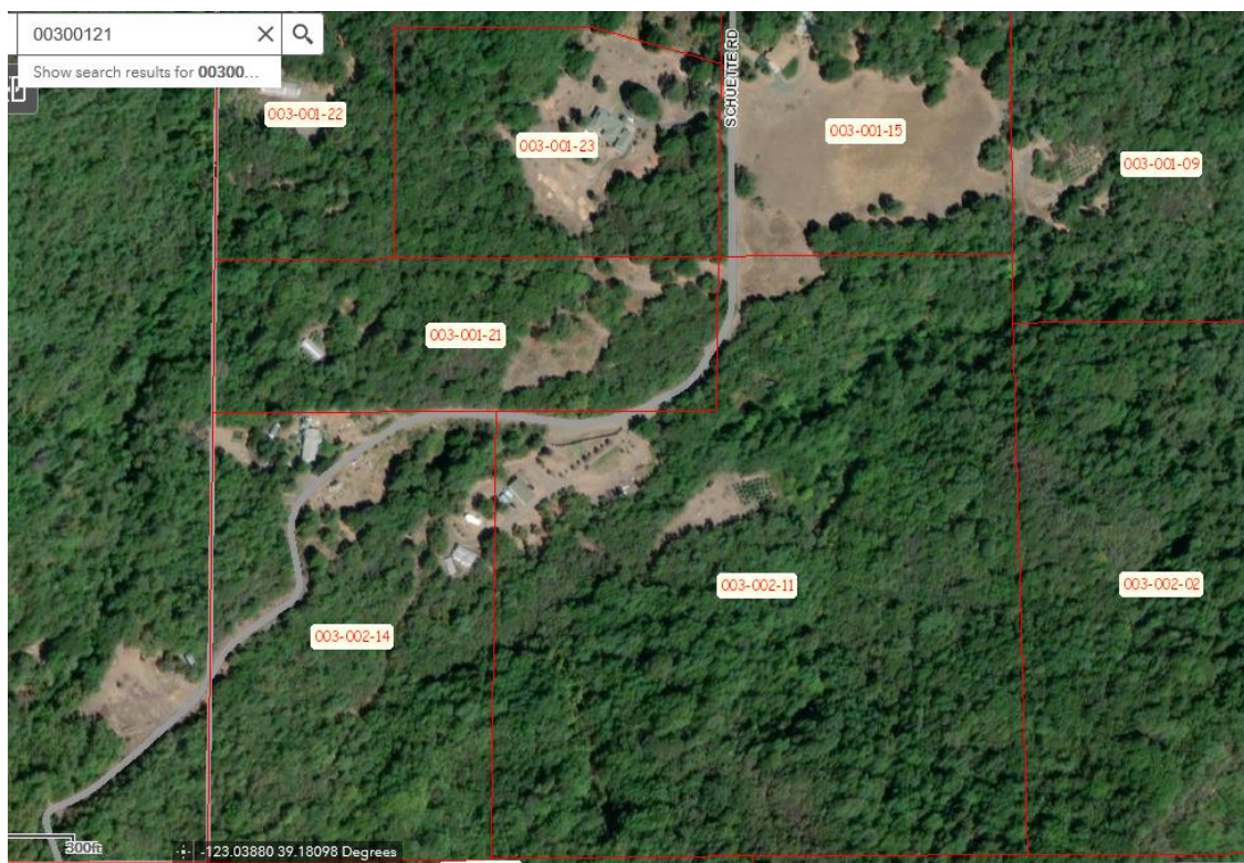
Aerial Photo of Site and Surrounding Properties

Other public agencies whose approval may be required (e.g., Permits, financing approval, or participation agreement.)