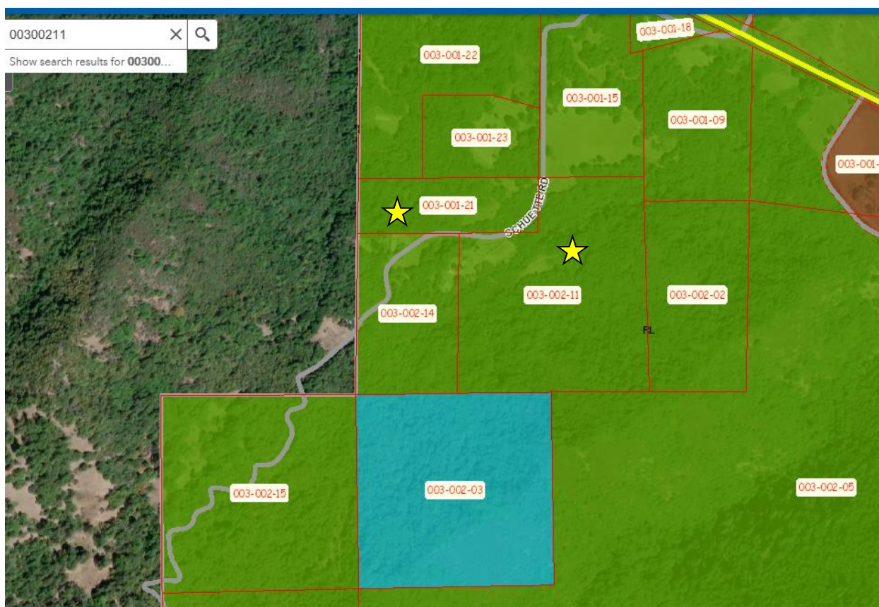
Zoning of Site and Surrounding Properties