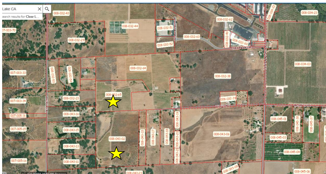
Aerial Photo of Site and Vicinity